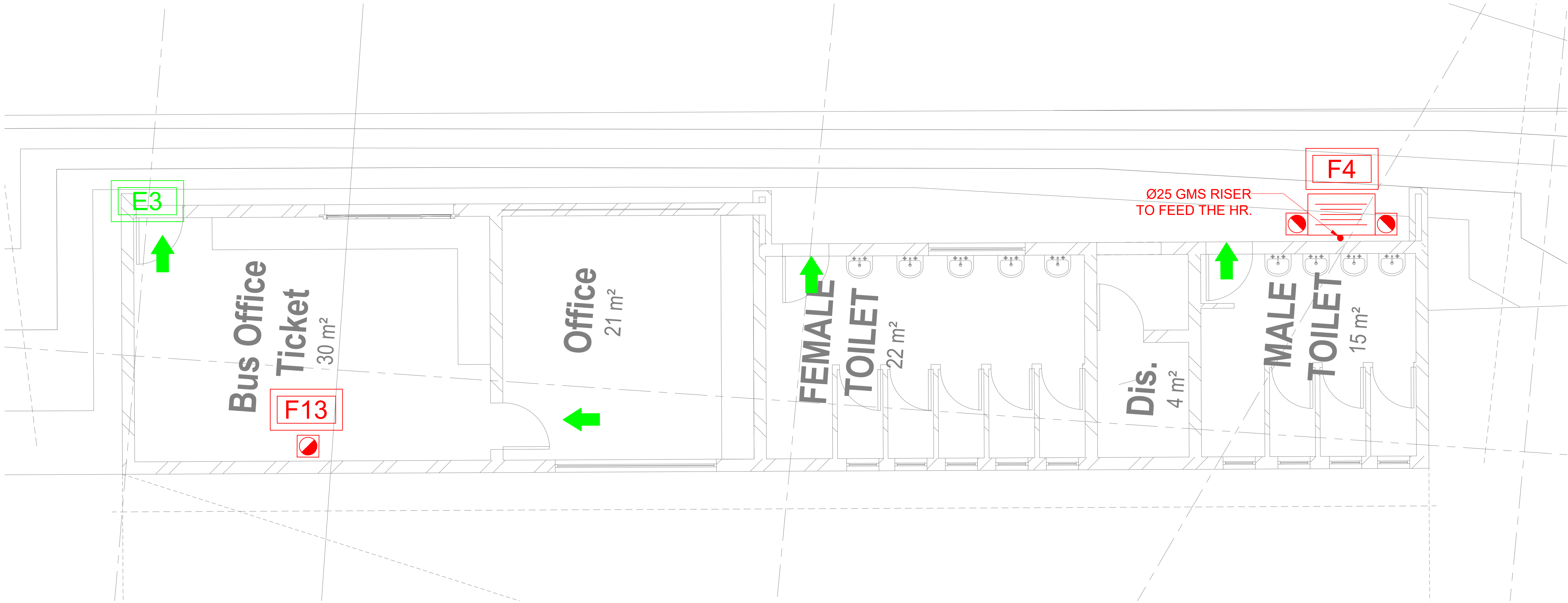
TICKET OFFICE FIRE PROTECTION LAYOUT SCALE 1:50